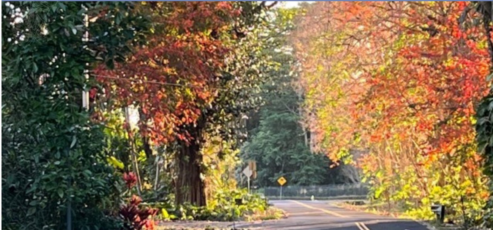
Wailuku Drive, Hilo

HAWAI'I ISLAND UNITED WAY NEWSLETTER SEPTEMBER 2023